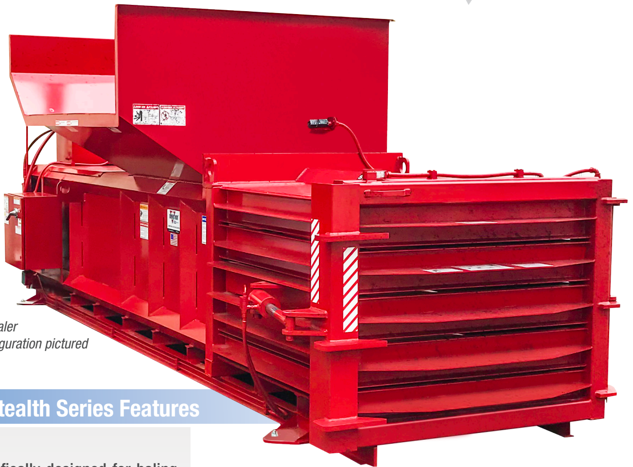
Stealth Baler 60" configuration pictured